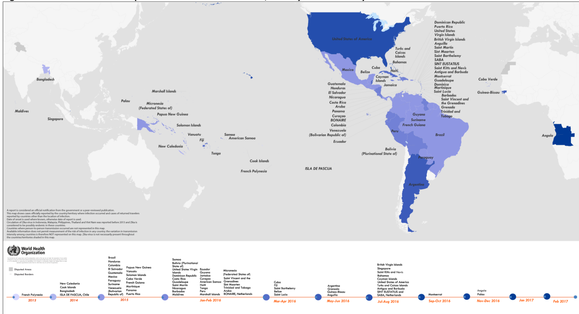
Figure 2. New detection of mosquito-borne Zika virus infections, January 2013–February 2017

A report is considered an official notification from the government or a peer-reviewed publication. This map shows cases officially reported by the country/territory where infection occurred, and cases of returned travellers reported by countries other than the location of infection. Date of onset is used where known, otherwise date of report is used. Circulation of Zika virus in Indonesia, Malaysia, Philippines, Thailand and Viet Nam was reported before 2013, and Zika is considered to be possibly endemic in these countries. Countries where person-to-person transmission occurred are not represented in this map. Available information does not permit measurement of the risk of infection in any country; the variation in transmission intensity among countries is therefore NOT represented on this map. Zika virus is not necessarily present throughout the countries/territories shaded in this map.