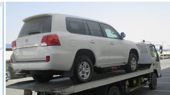
Armored vehicles leaving the Dubai depot for Djibouti, en route to Yemen.

Since the escalation of the conflict in March 2015, UNHRD has supported 6 Partners responding to the crisis by sending 413 MT of critical relief items, equipment and medical supplies to Djibouti and Yemen. Most recently, UNHRD dispatched 35 metric tons of medicine to Hoedida on behalf of WHO.