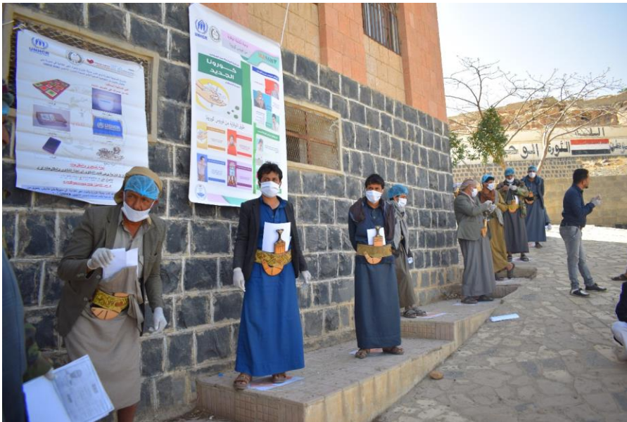
Newly displaced persons queuing to receive Non-Food Items and adhering to COVID19 preventative measures such as 1.5m physical distance and provided with masks, gloves and hand sanitizers. The distribution was managed by YGUSSWP on behalf of UNHCR in Bani Hushaysh district, Sana'a Governorate in March 2020.