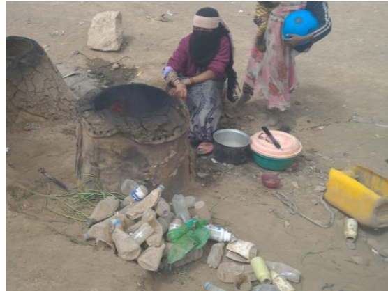
© Plastic bottles used as cooking fuel in Amran, Cluster Coordination Team, 2016.