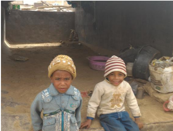
© Back of a truck used as shelter in Amran, Cluster Coordination Team, 2016.