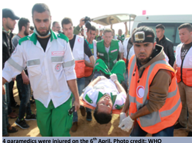
4 paramedics were injured on the 6 th April.