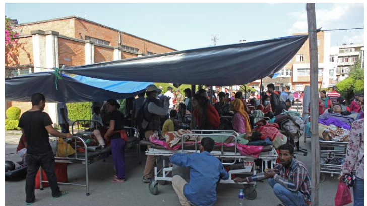
Patients evacuated and triaged at Tribhuvan University Teaching Hospital