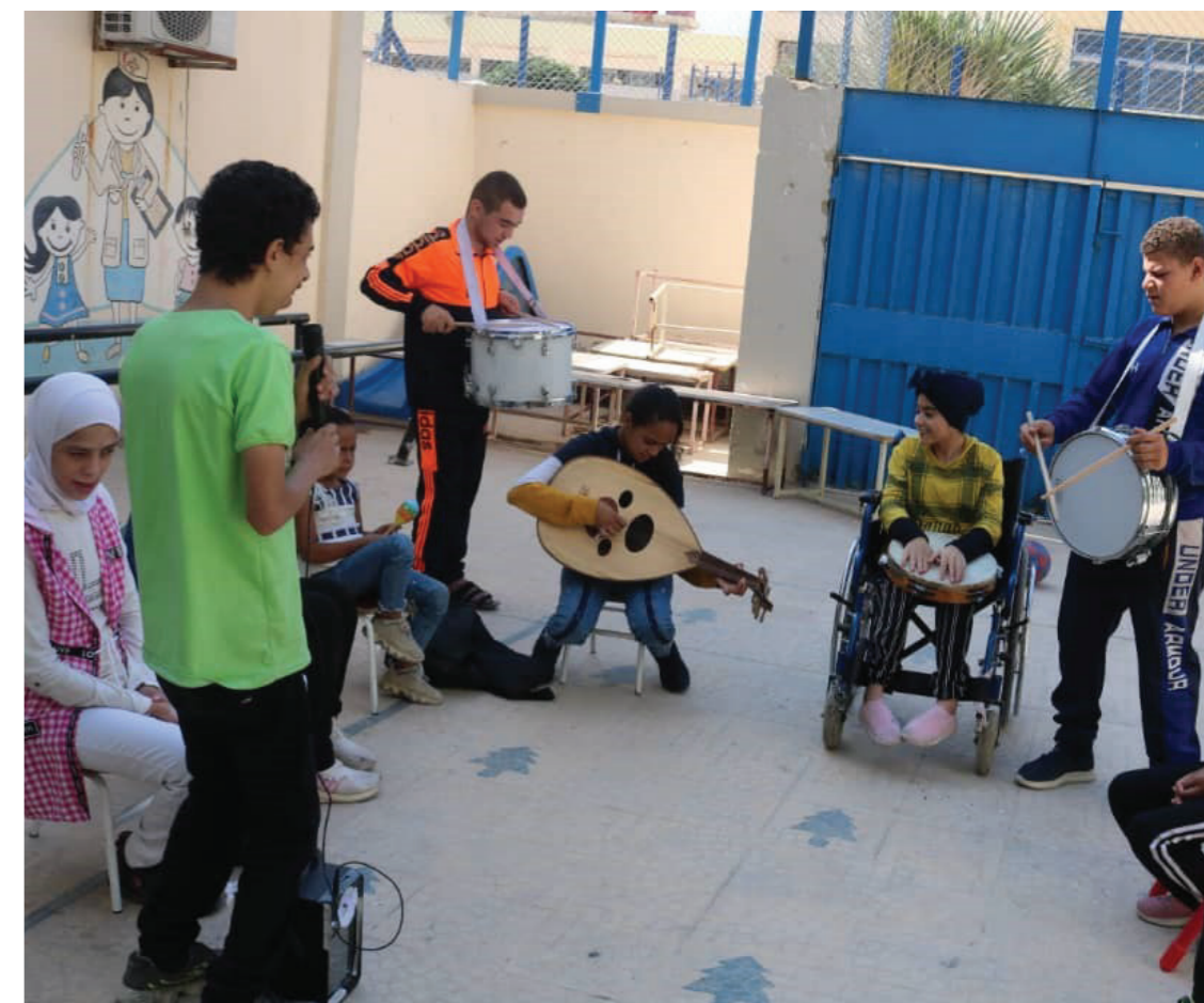
Recreational & sport activities during Summer Club for People with Disabilities in Sbeineh.