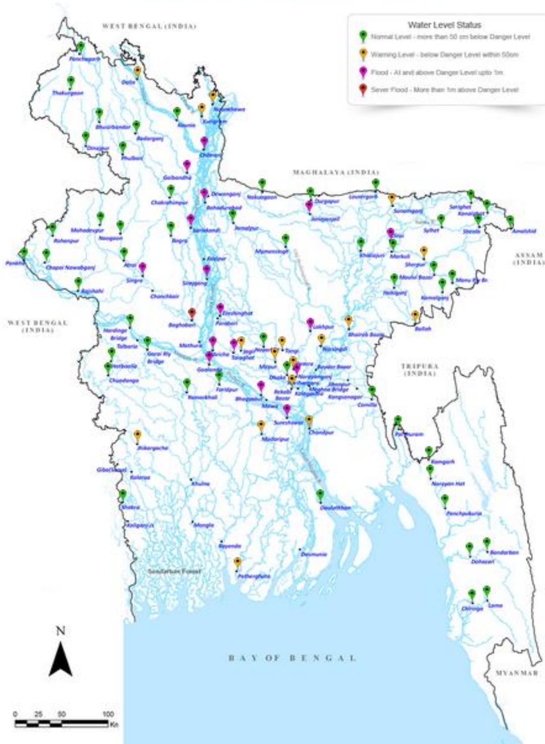
Last updated on Date: August 31, 2014

DMIC is the information hub of the MoDMR for risk reduction, hazard early warnings and emergency response and recovery activities.