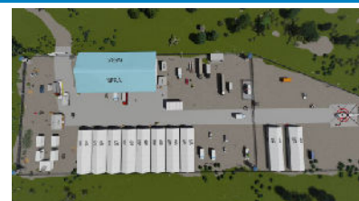
As of February 2021

Partner: UNICEF Loc: PoE Songwe Border Size (Tot): 52 m 2