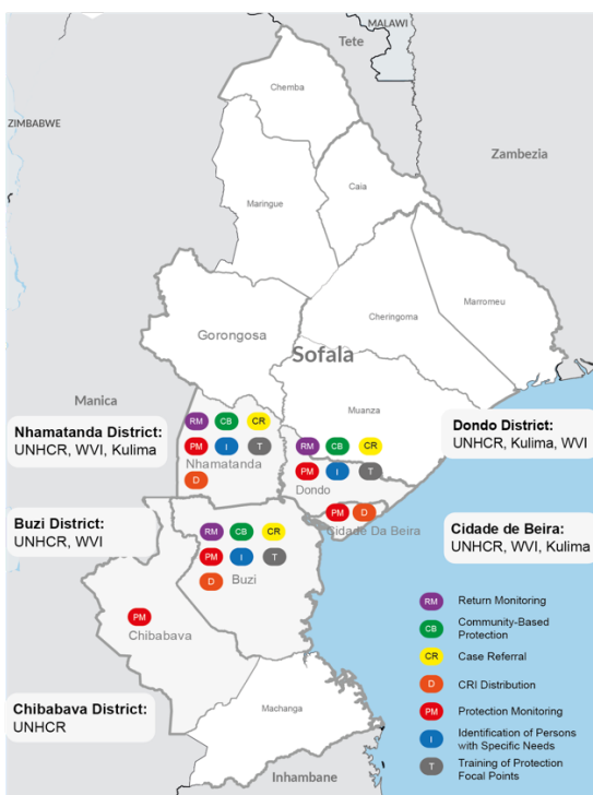
UNHCR and partners' presence and activities as at 30 September 2019.