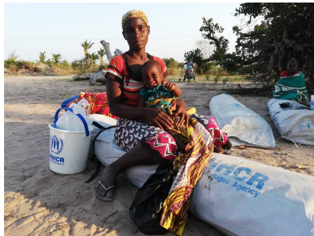
Distribution of core relief items to affected communities in Buzi district on 22 September 2019.

The Sofala Province Protection Cluster, co-lead by UNHCR, covers 22 Resettlement Sites in which 10,405 families (53,742 persons) live. There is no established Protection Clusters in the other three provinces where the remaining 7,303 families (34,625 persons) live.