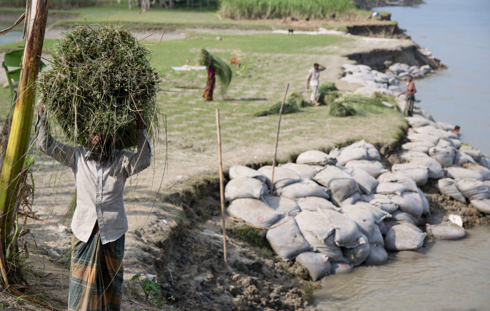
This community in Sirajganj, Bangladesh, is affected by river erosion. Many people were displaced several times due to the river erosion.

from agricultural villages are more likely to migrate. 18 As indicated in the IOM assessment study, these migrants tend to take illegal and often unsafe pathways as they are deemed easier and cheaper than migrating through regular channels. In fact, respondents to the IOM survey described instances of securing job opportunities through “brokers”, who would lead them to cross the forest into Thailand by foot, where they would be required to sleep and stay without nourishment for days before reaching their final destination. This could lead to situations of abuse and exploitation. 19