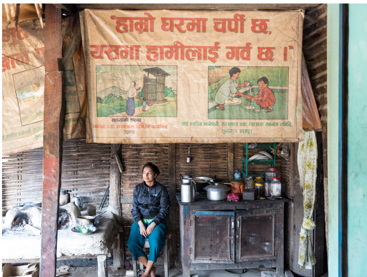
A little restaurant in Udaipur, Nepal, run by one of the many locals who have lost their houses and land because of river flooding. “The problem of flood is never ending here. When there is heavy rain, the river erodes the land. The largest river, Trijuga, is also there. There is a huge problem of flood in this region.”

The following table provides an overview of possible interventions before, during and after disasters, and where available with examples of related activities implemented by IOM in the Asia-Pacific region.