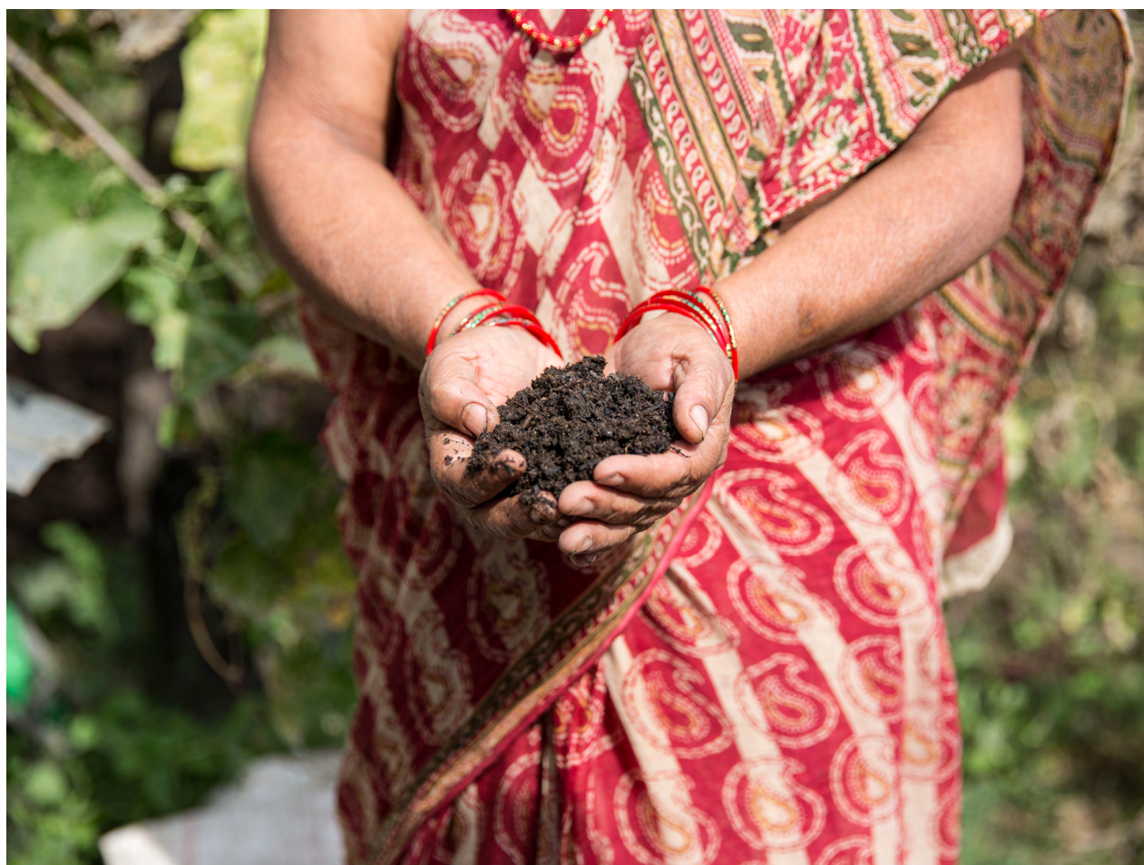
Organic fertilizer is being introduced to replace the industrial ones. Local farmers, such as those from Udaipur, make the organic fertilizers with cows and goats, urine and excrements and dried leaves.