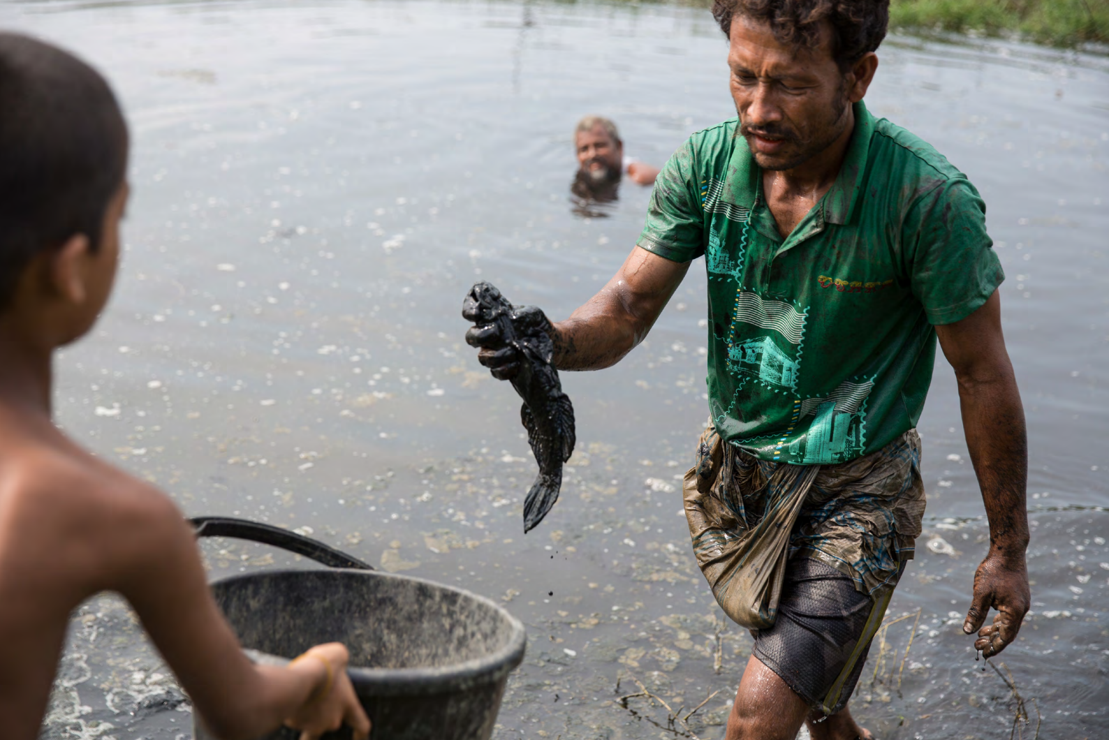
Fishermen in Shyamlapur, Bangladesh, fish about 22 kilos of fish per day and sell it on the local market in Cox's Bazar.

strategy, implying that slow-onset events may drive outmigration. Traffickers are likely to recruit in such source areas of climate migrants, but also at their destinations, such as in urban slums. On the other hand, when irreversible damage due to slow-onset events occurs (such as in the case of land erosion or repeated droughts), households may face increased debt and poverty. Increased desperation may push affected populations into the hands of criminal actors, and even into colluding with them, as seen in instances of men selling their wives or other female relatives 3 or parents selling their children 4 in order to cope with the losses associated with a changing climate.