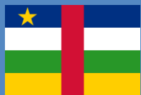
Central African Republic

Three SEA coordination mechanisms exist in CAR: HCT, UNCT, and SRSR/MINUSCA. Common actors bridge the task-forces at both senior and technical levels i.e. HC, DHC, UNHCR, UNFPA, UNICEF.