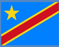
Democratic Republic of Congo, North Kivu