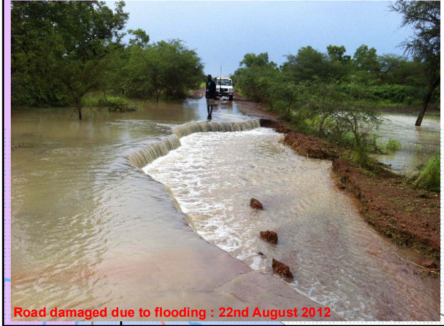
Road damaged due to flooding : 22nd August 2012