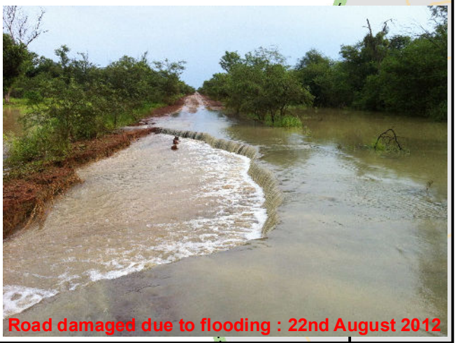
Road damaged due to flooding : 22nd August 2012