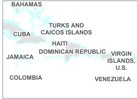
Country overview with topography displayed