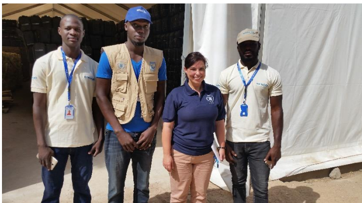
The common storage site in Banki has been operational since 6 November and is managed by INTERSOS on behalf of the Logistics Sector.