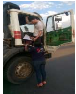
Convoy briefing in Juba – January 2017