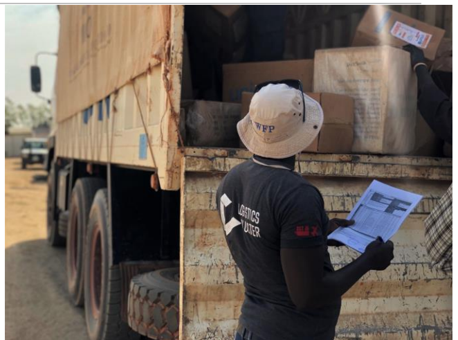
Beyond Bentiu Response, February 2021