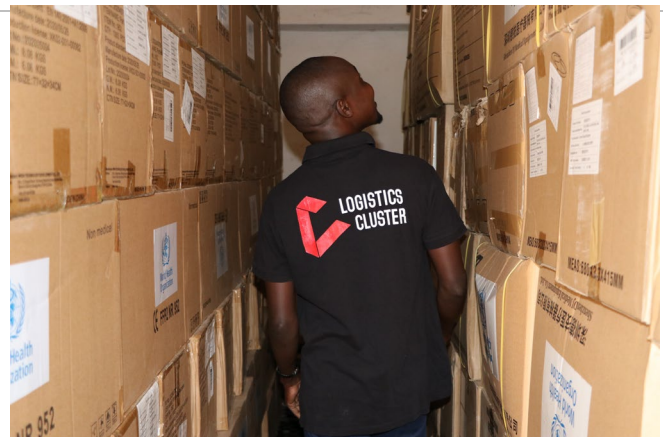
The Logistics Cluster Juba team reconciling COVID-19 commodities, August 2020.