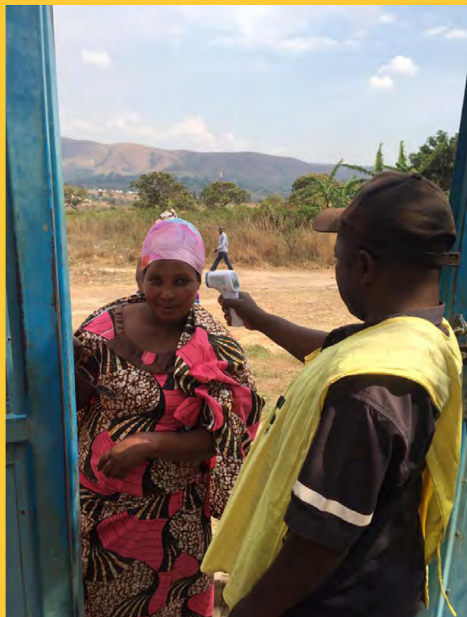
An IRC staffer takes the temperature of a woman before entering a Hope Centre in Burundi. IRC