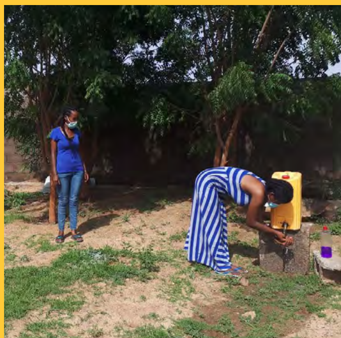
IRC incentive workers line up to wash their hands before entering into a safe space. IRC