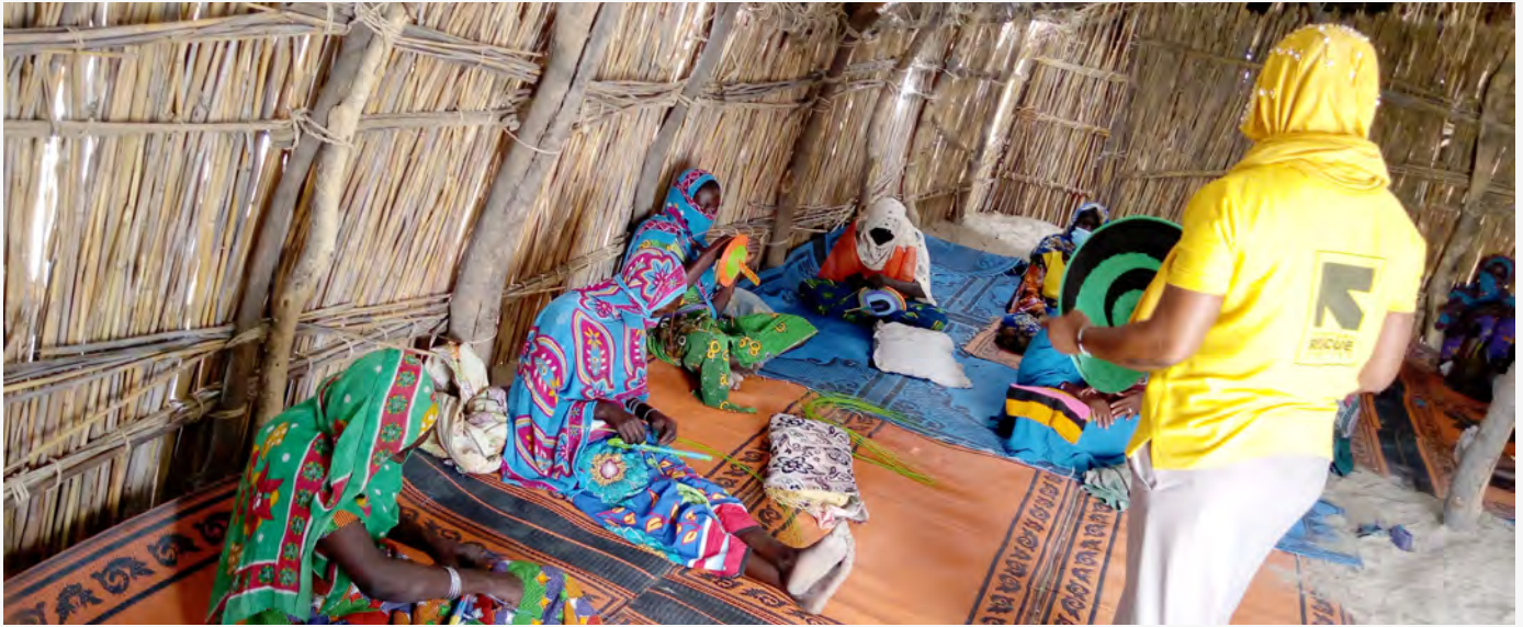
Women during a recreational basket weaving activity in Chad. IRC