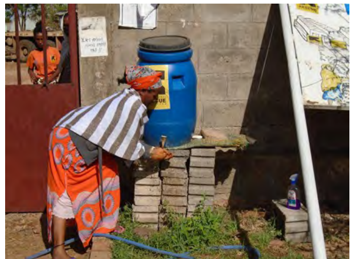
A woman is washing her hands before entering into a safe space in Ethiopia.

The current Global Humanitarian Response Plan (July – December 2020) is a prime example of the duality observed within the current humanitarian response to COVID-19. The July update of the GHRP differed from its predecessors by providing a rare in-depth analysis of how women and girls were being affected by COVID-19 across humanitarian contexts and focusing specifically on GBV as “one of the most nefarious consequences of the pandemic”. xii The narrative about impacts of the pandemic on violence against women and girls was robust. However, the level of specificity and urgency in preventing and responding to GBV in the narrative was not matched in the sections of the GHRP that direct response efforts and establish accountability measures.