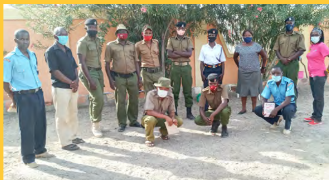
Members of the police in Turkana county after finishing a two day training to foster a comprehensive and coordinated response to GBV and to strengthen the capacity of police officers to adequately respond to GBV in Lodwar, Kenya.

“Provide separate toilet for female and male, construct disability friendly latrines.” (Female respondent, Ethiopia Safety Audit)