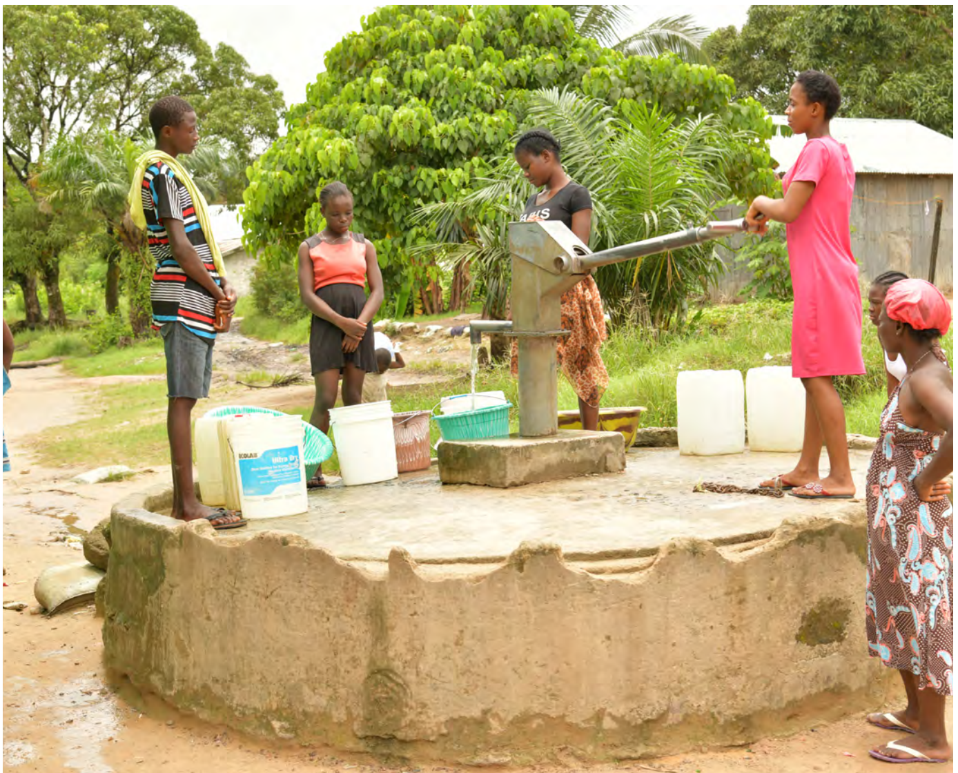
Adolescents are fetching water at a water point in Liberia.

Many female respondents feared that even when schools opened, girls would not be allowed to return. Thus, there were requests to ensure that schools open as soon as possible, but also a focus on the need for advocacy to ensure that when schools do open, girls can go back and be educated. Other suggestions called for more safe spaces, or educational activities for girls where they can share their experiences and difficulties, and access reproductive health information to reduce the risk of teenage pregnancy.