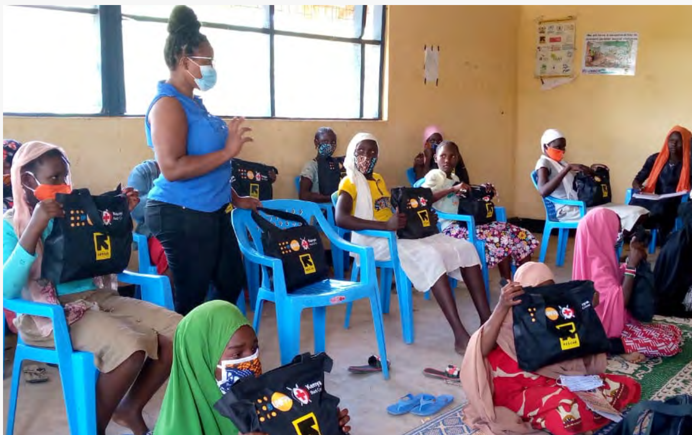
Distribution of dignity kits to adolescent girls in Kenya.

Overall, refugee and host community women and girls in Kenya continued to have access to essential GBV services throughout the pandemic. Strong advocacy for the inclusion of GBV services in humanitarian planning and response, capacity building for GBV actors and local structures, effective coordination among GBV actors, and the involvement of women's organisation were all highlighted as critical factors enabling a sustained attention towards the needs of women and girls in the country, including in refugee camps. While insufficient resources limited the extent to which services could be adapted or even expanded to respond to increased risks for women and girls, ultimately the GBV sector was successful in its efforts to ensure that survivors of violence were not left behind.