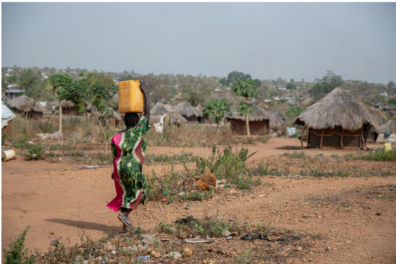
A woman carries a jerrican after collecting water at a water collection point in Bidibidi camp, Uganda.