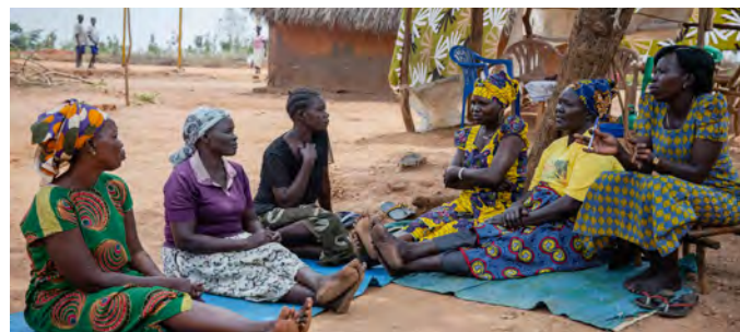
Members of the Togoleta women's group counsel a woman from Bidibidi camp, who is seeking their advice in a difficult situation.

According to key informants, there was a delayed recognition, particularly within public health teams on the ground, of the impact of COVID-19 on women and children, particularly girls, including in terms of caring and hygiene responsibilities, sexual and reproductive health, and GBV. This partial or delayed acknowledgment resulted in early public health interventions that did not prioritise providing PPE specifically designed for female health staff, nor appropriate menstrual hygiene management supplies, nor the ongoing provision of abortion care and other essential sexual and reproductive health services. Public health strategies also relied, in some humanitarian contexts, on the repurposing of women and girls' safe spaces as COVID-19 isolation or treatment centres, without any alternative arrangements put in place to ensure continuity of lifesaving GBV services.