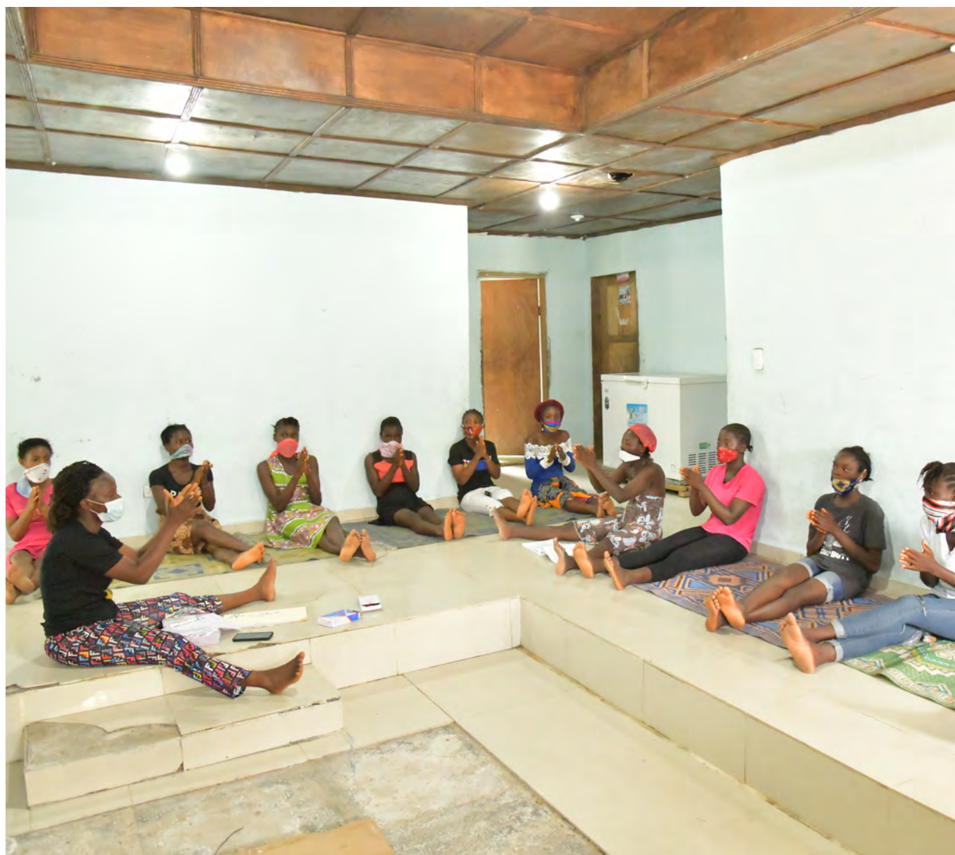
Adolescent girls during a girls meeting in a safe space in Liberia.

Safety Audits in each location were primarily implemented to keep in touch with women focal points within each community during limited movement due to COVID-19 infection restrictions. Regular calls with community focal points and a standardised interview guide enabled WPE teams in each location to identify risks and barriers to service access and to advocate with humanitarian actors to mitigate risks and remove barriers to women and girls safe and equitable access to aid in each setting. This data was then also shared for global analysis and advocacy. Two primary questions guided the data collection and analysis which informs this report. Firstly, the safety audit interview data sought to answer the question: How did COVID-19 affect the lives of women and girls in emergencies? ; and secondly, all data contributed to addressing the question: Did the humanitarian sector prioritise GBV services for women and girls in its COVID-19 response?