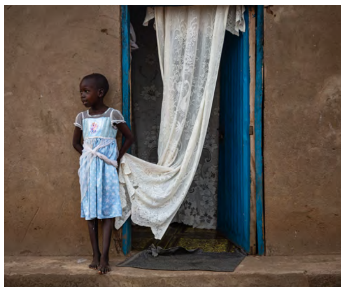
A girl is standing outside her family's house in Bidibidi camp, Uganda.

"The days gone by if we couldn't find the social worker we had to wait for her the other day but for the moment we talk by phone and that helps us a lot and there are many people who give us good reports concerning this service." (Female respondent, Burundi Safety Audit)