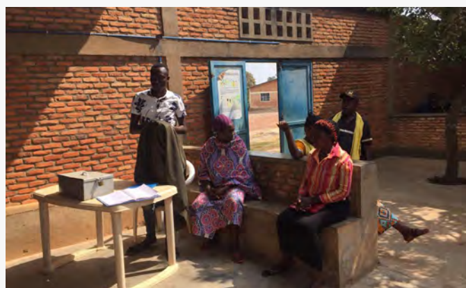
A session of IRC's economic and social empowerment (EA$E) framework is conducted in Burundi. IRC

The GBV sub-sector in Burundi was able to advocate for the inclusion of women and girls' needs and GBV services in planning and preparedness exercises by humanitarian actors. In addition, even though the government did not establish a national lockdown or other restrictive measures, GBV service providers working in refugee camps were able to plan and, to a certain extent, implement adaptation measures to limit the spread of COVID-19, such as using tablets and mobile hotlines to remain in touch with GBV survivors and using radios to continue awareness raising. Despite the extensive planning activities, GBV actors struggled to secure sufficient funding to cover additional needs. Ultimately, this case points to the need to not only plan, but secure funding for the planned interventions.