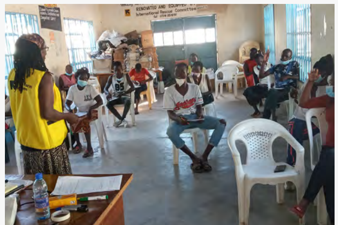
A community volunteer conducts a one day sensitisation session with adolescent boys to address the role of men and boys in GBV prevention and response in Lodwar, Kenya.

While the positive response from the government and the humanitarian leadership in Kenya facilitated the necessary prioritisation and adaptation of GBV services across refugee camps and host communities in the north of the country – the continued lack of funding did not allow GBV responders to capitalise on these commitments to scale up programming to meet the increasing demand.