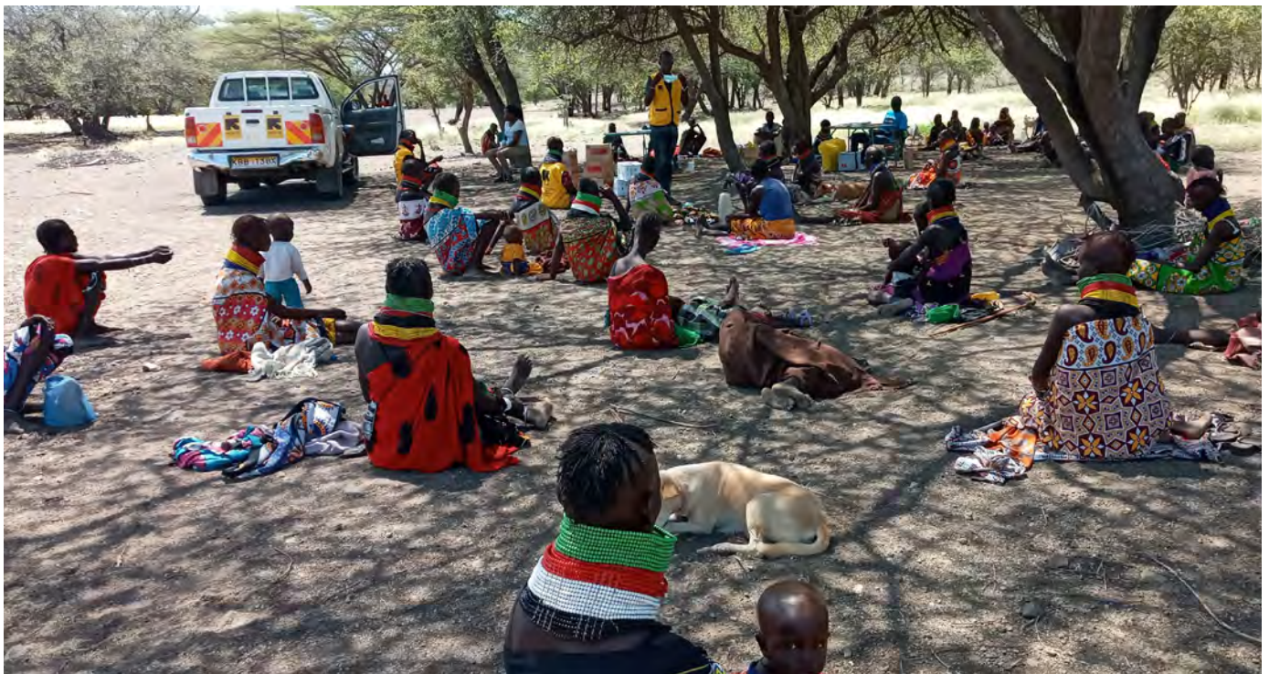
IRC staff conduct mobile outreach in Turkana, Kenya.

This report concludes with recommendations based on IRC interviews with displaced and refugee women, women-led organisations, and humanitarian GBV experts. Their voices, experiences, and knowledge need to translate into effective, accountable, and consistent humanitarian action that truly puts women and girls at the centre of COVID-19 response and recovery efforts.