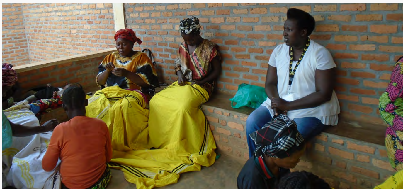
Women during a recreational sewing activity in Burundi.

"Mental preparation is what was done, but there were no funds coming through. Yes, the women's centre remained opened and operational, but survivors could not access it due to increased cost of transport and the fact that most women lost their livelihoods with the closure of the borders" (National GBV expert)