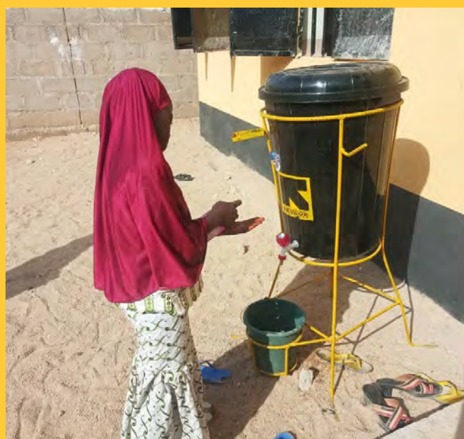
Hand washing practice at a hand washing station by some of the adolescent girls accessing the safe space in Mubi North, Nigeria.

The pandemic is yet another example of how complex humanitarian crises disproportionately affect the most marginalised women and girls. But it also offers us a chance to learn and build back better. xxi The findings of this report clearly highlight the needs to shift the ways of working within the humanitarian crisis response towards a more inclusive approach. We need to actively seek out and listen to voices of those most marginalised. Their perspectives needs to feed into decision making at the local and global level alike. This calls for agreed channels and procedures to ensure actors like women's rights organisations working in their communities are resourced and empowered to meaningfully participate in humanitarian planning.