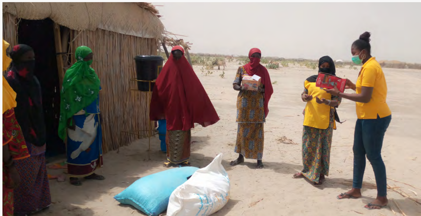
Distribution of dignity kits to women's groups in Chad.