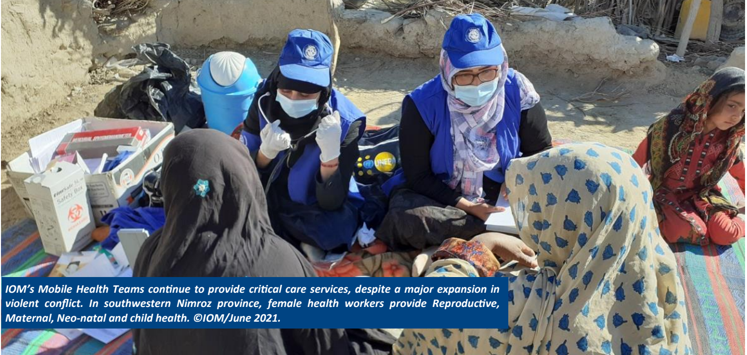
IOM's Mobile Health Teams continue to provide critical care services, despite a major expansion in violent conflict. In southwestern Nimroz province, female health workers provide Reproductive, Maternal, Neo-natal and child health.