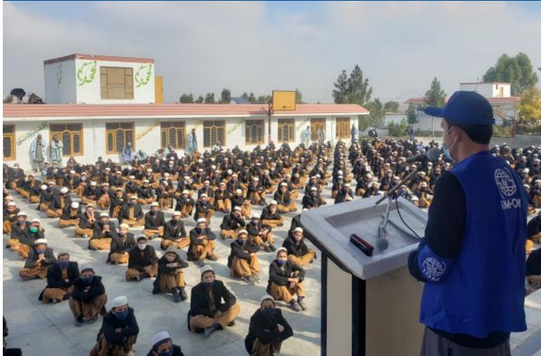
Given rising COVID-19 infection rates around Afghanistan, IOM's mobile health teams continue to prioritize outreach and awareness sessions. This includes the systematic dissemination of COVID-19 messaging in public schools across southern Kandahar province linked to health consultations and testing for students showing symptoms. @IOM, November2020