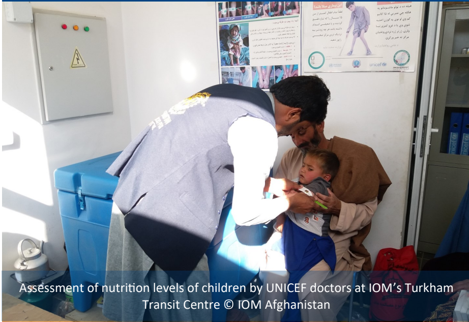
Assessment of nutrition levels of children by UNICEF doctors at IOM's Turkham Transit Centre