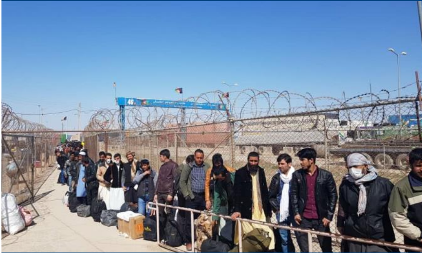
Afghan migrants line up for temperature checks and symptom screening carried out by the Ministry of Public Health at the Islam Qala border on 14 March. IOM is actively supporting surveillance activities and data collection within the COVID-19 response. @IOM March 2020