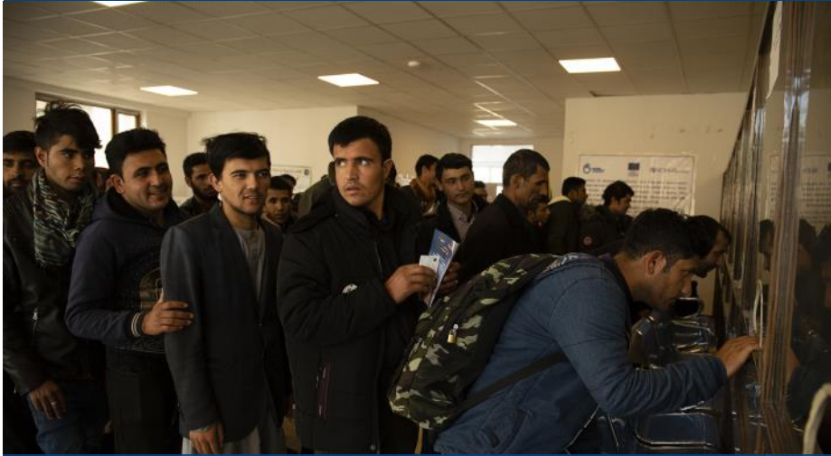
Returning Afghans registering in the Afghan Returnee Information System with the Directorate for Refugees and Repatriation at the Milak border in Nimroz.