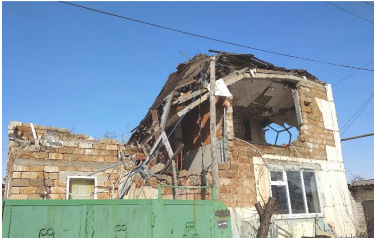
Shelter monitoring in Popasna, Luhansk oblast, Ukraine.

Escalation of the conflict. In March 2021, the geopolitical context of the armed conflict in eastern Ukraine deteriorated. Scaled up military presence along the eastern and southern border coupled with intensification of military clashes and use of heavy weapons. As a result, the Ukraine Humanitarian Country Team agreed to strengthen the emergency response preparedness and review the Inter-Agency Contingency Plan. Based on the agreed contingency scenarios, the Shelter/NFI Cluster reviewed its HRP activities (also establishing a priority order in case of escalation), its target groups and the budget. The Cluster estimated that in the contingency plan scenario 55,700 more persons will need shelter, NFI and winterization assistance, bringing the HRP sectoral target to 174,700 persons. 6,5 additional million USD will be required to fund the revised Cluster activities and target. The trigger that will activate the scenario is – “more than 15 inhabited houses damaged per day, more than twice a week” 1 . The number corresponds to the “pre-ceasefire” situation and serves as a threshold for triggering the scenario.