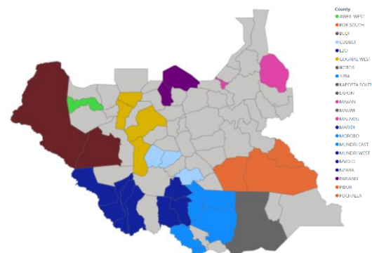
COVID-19 vaccination per country Up to 11 August 2021