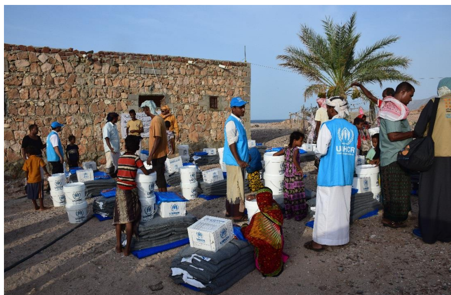
UNHCR emergency household supplies arrive on Socotra to help 500 families who have been displaced by the tropical storm which swept through the island.

On 23 May 2018, tropical cyclone "Mekunu" resulted in flooding on the island of Socotra and parts of Yemen's eastern mainland, for which the Yemeni Government declared a state of emergency. Humanitarian partners in Aden mobilised relief items and sent an Inter-Agency assessment team to Socotra.