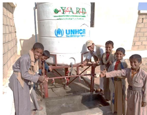
IDP children in Al Maryam IDP hosting site smile in front of a new water system installed by UNHCR and partner YARD.

As the Camp Coordination and Camp Management (CCCM) cluster lead, UNHCR provided two new replacement tents for Dharawan IDP hosting site in Hamdan district, Sana'a governorate, for use by health care facilities run by Ministry of Health. Some 265 families are currently seeking temporary shelter at the site. IDPs in the area have recently faced regular threats of eviction from landowners, who as members of the host community are seeking to be included as part of humanitarian distributions to vulnerable persons. Preventing and resolving evictions and land right disputes remains a priority for UNHCR and CCCM cluster, who recently developed a process map to guide stakeholders on how to negotiate and explore long-term solutions, such as establishing new IDP hosting site or facilitating relocations to existing ones.