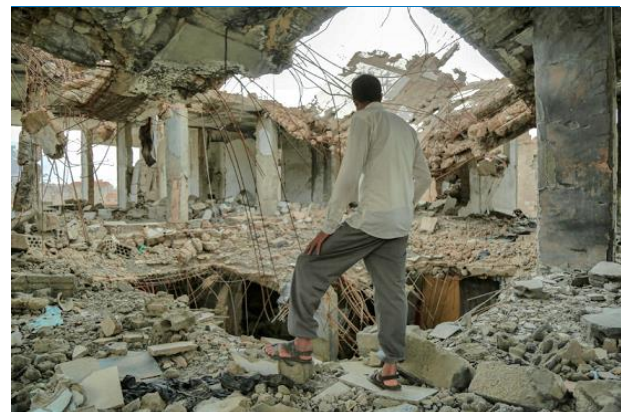
A man stands in one of his neighbourhood houses in Sana'a. The house was targeted by an airstrike on 14 January 2016, which resulted in the death of multiple civilians. As of today, the neighbourhood is still in ruins.