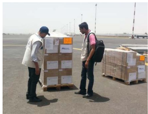
Trauma kits arrived in Sana'a airport and will be distributed next week.