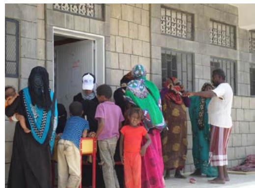
International Medical Corps' IDP assessments in Taiz.