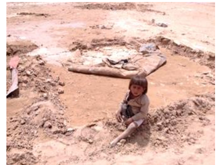
Heavy rain and flooding destroyed this young IDP's shelter in Marib governorate.

Heavy rains and flooding hit several districts of Sana'a, Amant Al Asimah, and Marib governorates, causing extensive damage to IDP shelters and public infrastructure. In Marib in particular, sandstorms, rain and floods severely damaged 29 IDP hosting sites across four districts. UNHCR conducted rapid needs assessments in the three affected governorates and immediately assisted 500 internally displaced (IDP) families with 2,510 blankets, 1,600 mattresses, kitchen sets and 140 tents as a preliminary response. Distribution gaps still remain for shelter, mattresses, blankets and food. UNHCR is following up with the Camp Coordination and Camp Management (CCCM) and Shelter Clusters for a coordinated response. UNHCR Field Office Ibb also conducted a mission to Sayilat Jiblah IDP hosting site in Ibb Governorate, which currently hosts 80 families. The site was also badly impacted by the recent rain, with at least 15 IDP shelters destroyed and others partially damaged. Given that the IDP site is located next to a waterway and it is only the beginning of the rainy season, UNHCR advocated with local authorities to identify an alternative and safer site.