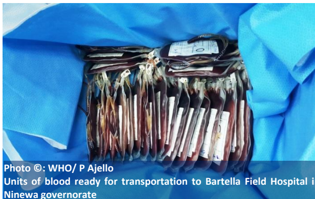
Units of blood ready for transportation to Bartella Field Hospital in Ninewa governorate