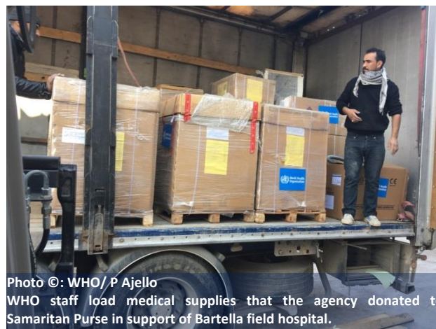
WHO staff load medical supplies that the agency donated to Samaritan Purse in support of Bartella field hospital.