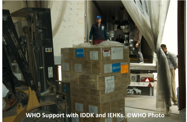
WHO Support with IDDK and IEHKs.