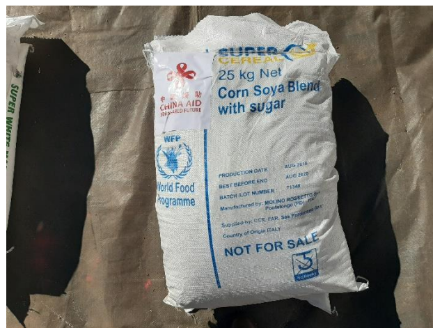
Super Cereal at a distribution point.