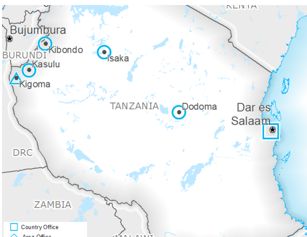
Tanzania: Emergency Food Assistance to Burundian Refugees