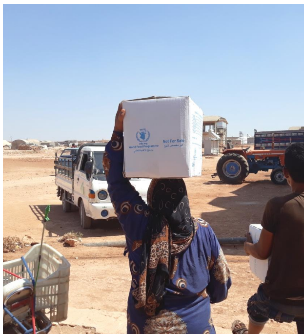
WFP food distribution in Idlib governorate, September 2019.