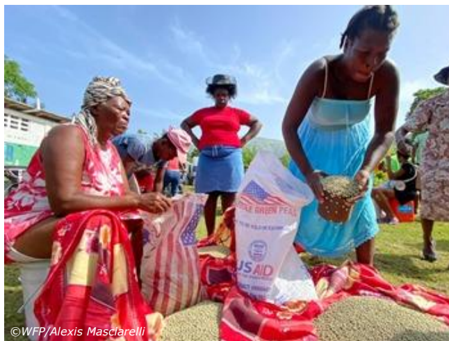
WFP distribution in Maniche (South)