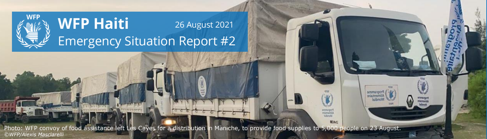
Photo: WFP convoy of food assistance left Les Cayes for a distribution in Maniche, to provide food supplies to 5,000 people on 23 August.