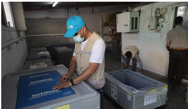
UNICEF staff supervising the delivery of COVID-19 vaccines to the Ministry of Health warehouse in the Gaza Strip