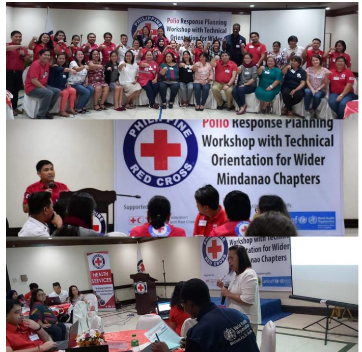
The Red Cross will be vaccinating 100,000 children under 5 during the next round of synchronized polio vaccination campaign on 25 November-7 December targeting 4.4 million children under 5 in National Capital Region (NCR) and 6 regions in Mindanao.