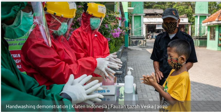
Handwashing demonstration | Klaten Indonesia | Fauzan Ijazah Veska | 2020