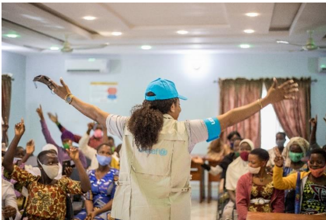
UNICEF National Ambassador Zeynab Abib exchanging with girls on the occasion of World Children’s Day in Tchaourou

As part of the Faaba-COVID project to eradicate child marriage, 43 adolescent girls aged 9-15 were trained on photography and vlogging techniques to amplify their voices. Three videos produced by girls on education and COVID-19, climate change and access to schools were shared with the public. In cooperation with “7 Days for 1 film”, 12 young female directors teamed up to create a film on gender-based violence as part of the 16 days of activism against GBV. UNICEF Benin participated in the yearly “Every Child Alive Campaign” by capturing the first moments of life of babies born on 1 st January 2020. The Country Office published a thank you video to acknowledge community efforts to respond to the pandemic in Benin.