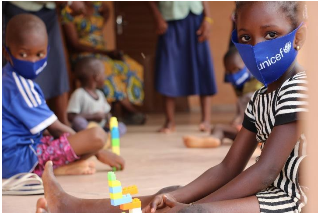
A young girl plays at a UNICEF-supported child friendly spaces in Gogounou