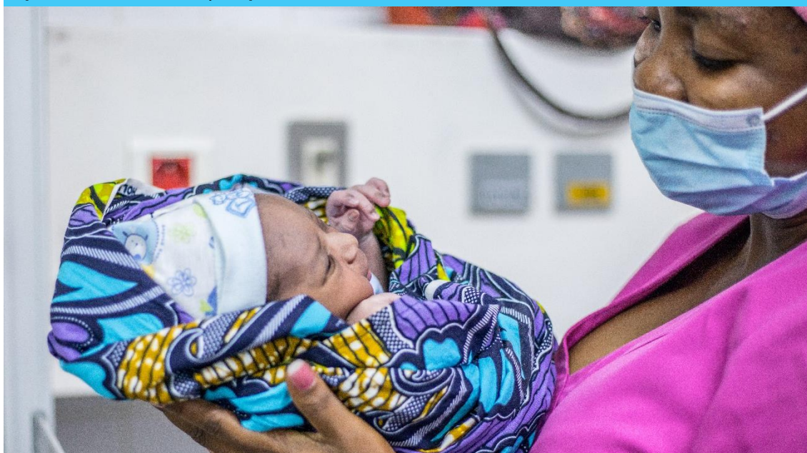
One of the first babies of 2021 born in Benin was safely delivered at the National University Hospital Center in Cotonou at 00:37 on 1 January 2021