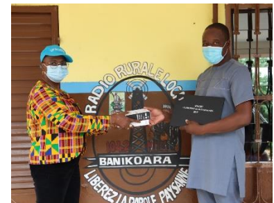
Reine travels to Northern Benin to support community radios