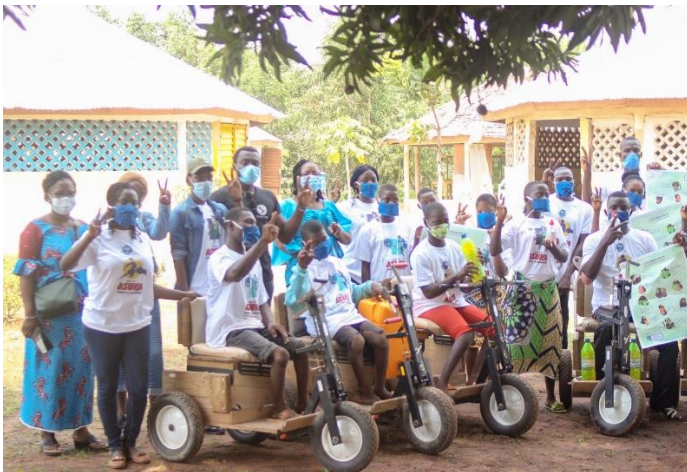
Youth-led association "Saturday in the village" sensitizing young people with disabilities on COVID-19 prevention measures in Akassato

Through the ASUKA campaign, a youth-focused campaign aimed at mobilizing and engaging youth on COVID-19 prevention and response efforts, Sèmè City, UNFPA, VLISCO and UNICEF supported 20 youth associations in expanding sensitization activities at the community level. Through this public-private partnership, 150,000 people were reached in all 12 departments (37 localities).