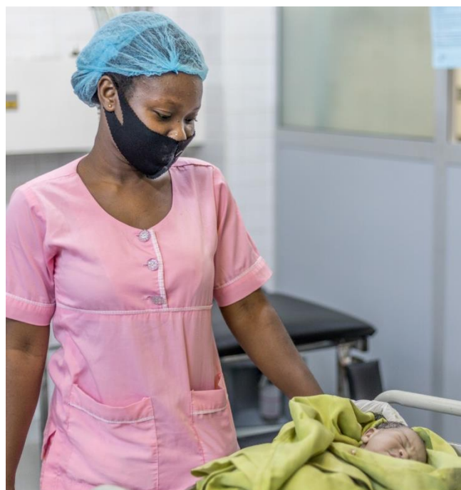
A midwife takes care of a newborn at a UNICEF-supported hospital in Cotonou

48,543 children and adults received psychosocial support