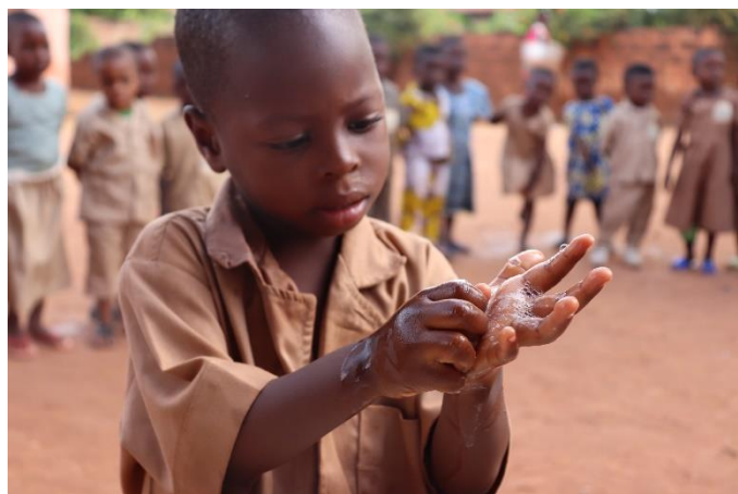
A child in pre-school in Zakpota washes his hands before lunch

To date, 925,144, people received WASH services. Community-led total sanitation interventions in the Zou department are being rolled out by five NGOs supported by UNICEF, including through the promotion of handwashing habits and barrier gestures. According to preliminary reports, 44,412 new households installed handwashing devices, amounting to a total of 70,022 handwashing devices set up, benefiting 259,599 people. These strategies will be reinforced in 2021 to strengthen community resilience to the COVID-19 pandemic.