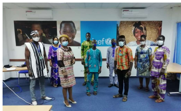
Training of trainers on child friendly spaces in COVID-19 context

May, the Government tested hundreds of teachers for COVID-19 and provided masks for children to mitigate the risk of infection in schools. UNICEF and other Technical and Financial Partners assisted the Government in submitting its proposal to the Global Partnership for Education to support “response and early recovery” of the education sector as a result of the COVID-19 pandemic. In cooperation with Sèmè City, Epitech, UNFPA, MTN Bénin, PwC and the Benin Bloggers Association, the Country Office is supporting three teams of young innovators to develop a web platform, a TV programme and a radio show to facilitate continuity of learning.