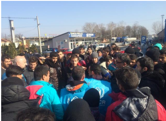
UNHCR team counselling individuals returned from Croatia on the right to seek asylum in Serbia, Šid (Serbia), ©UNHCR, 17 February 2016

767 refugees departed to Croatia on one train, 145 were denied boarding by Croatian authorities.