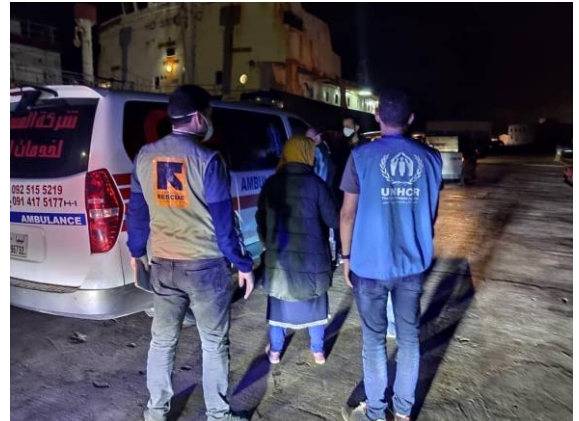
UNHCR and partner, IRC at the Tripoli Naval Base during a disembarkation operation.

As of 10 June, 4,231 refugees and migrants have been registered as rescued/intercepted at sea by the Libyan Coast Guard and disembarked in Libya in 2020. For the same period in 2019, the figure was 2,887. In addition, on 11 June, some 240 individuals disembarked at the Tripoli Naval Base. UNHCR and its partner, the International Rescue Committee (IRC), were present at the disembarkation point to provide urgent medical assistance and core relief items (CRIs) before individuals were transferred to detention centres by the Libyan authorities.