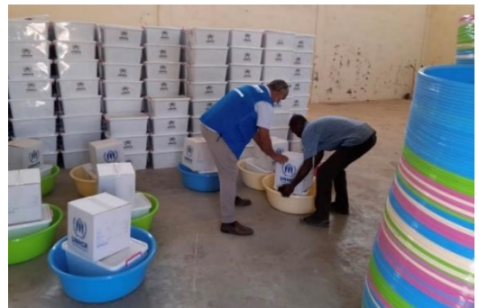
Distribution of hygiene kits for IDPs in Benghazi.

On 18 August, UNHCR and its partner, LibAid started the distribution of hygiene kits to over 1,300 Tawerghan internally displaced families (IDPs) in Benghazi. As of 19 August, UNHCR has distributed CRIs and hygiene kits to some 25,000 IDPs across the country.