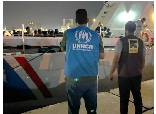
UNHCR and partner IRC at the Tripoli Commercial Port during a recent disembarkation operation.

So far in 2021, a total of 21,120 refugees and migrants have been reported as rescued / intercepted by the Libyan Coast Guard (LCG). On 19 August, 61 individuals were returned to the Tripoli Commercial Port, adding to a total of 2,412 refugees and migrants who have been disembarked so far this month. The primary nationalities of those disembarked this year include Sudanese (17 per cent), Bangladeshis (11 per cent) and Malians (11 per cent). UNHCR and medical partner the International Rescue Committee (IRC) continue to be present at disembarkation points to provide urgent medical assistance and Core Relief Items (CRIs).