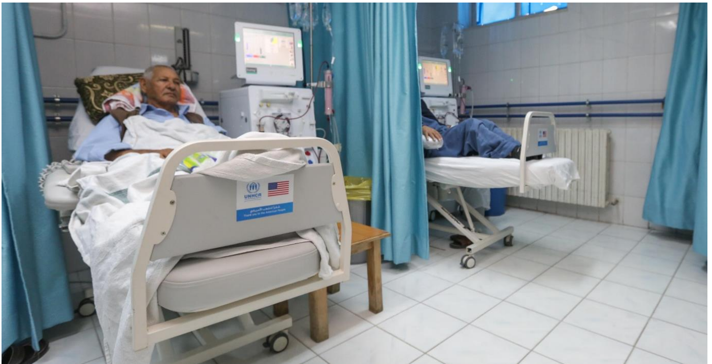
Patients receiving haemodialysis treatment at the UNHCR/U.S.-supported Al-Totnaji hospital in Amman.

UNHCR continues to work closely with the GoJ to meet the immediate and short-term health needs of individual refugees while also improving the health services available for the host community in the long term.