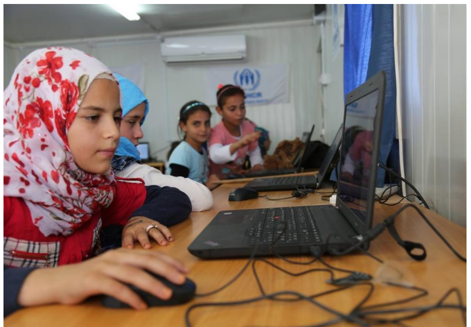
Syrian children benefiting from computer training in one of Azraq refugee camp's four community centres as part of a UNHCR skills training programme. Over half of Azraq's population – 56 per cent – are children.

*This operational update covers activities for the month of January 2017.