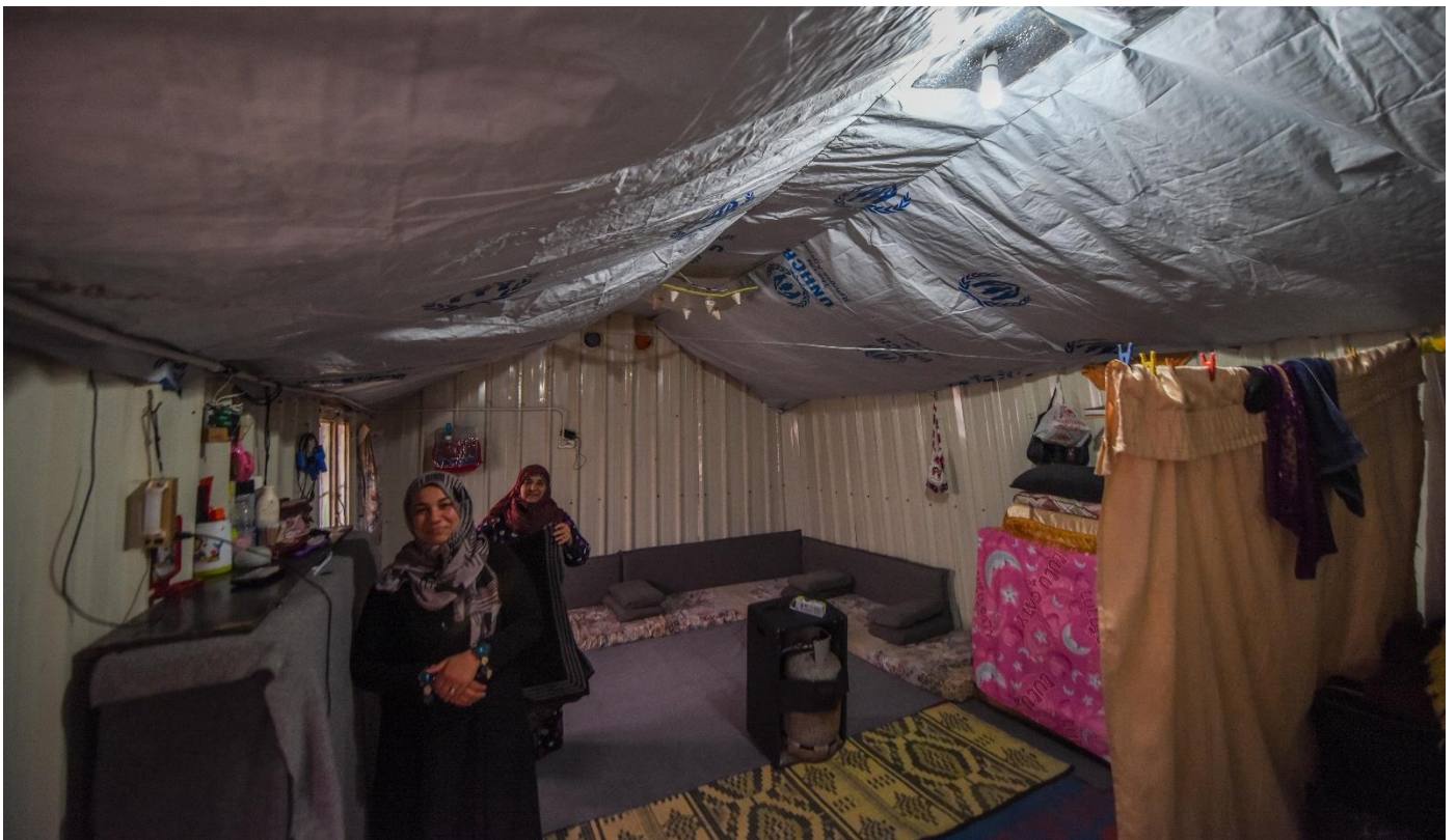
Shelters in Azraq camp will be powered by green energy in 2017 thanks to a solar farm funded by the IKEA Foundation.

Since 2014 the IKEA Foundation has donated US $ 4 million to lighting and renewable energy projects in refugee camps in Jordan. The IKEA Foundation is UNHCR's largest private sector partner, helping to provide shelter, care, education and energy to refugee and host communities in Asia, Africa and the Middle East.