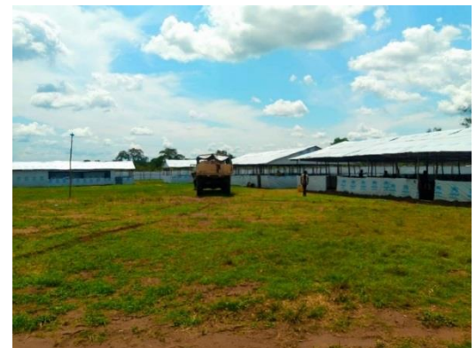
Mugamba Transit Center, halfway between the Angolan border and Tshikapa, Kasai Province.