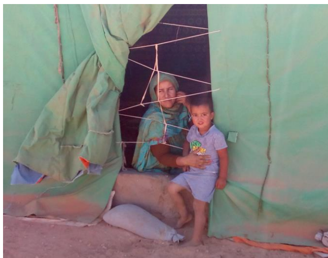
Shelter remains a critical need for Sahrawi families.

UNHCR leads the provision of humanitarian assistance to Sahrawi refugees, which involves coordination with all humanitarian actors in Tindouf.