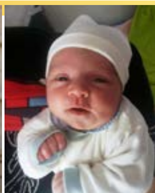
2015 | Obada | Baby # 3,000