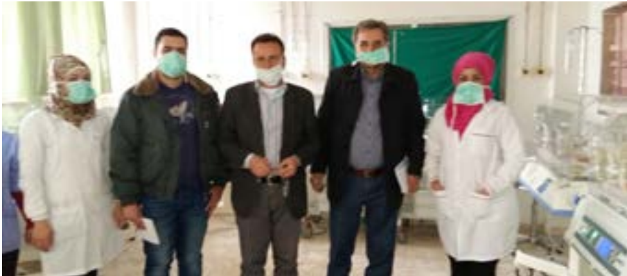
UNFPA staff in Al Hasakah during the mission to the health facilities.