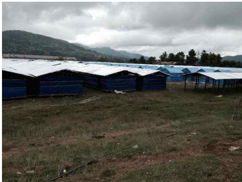
Long houses and tents for longer term accommodation S Barton Hakha 10/9/15