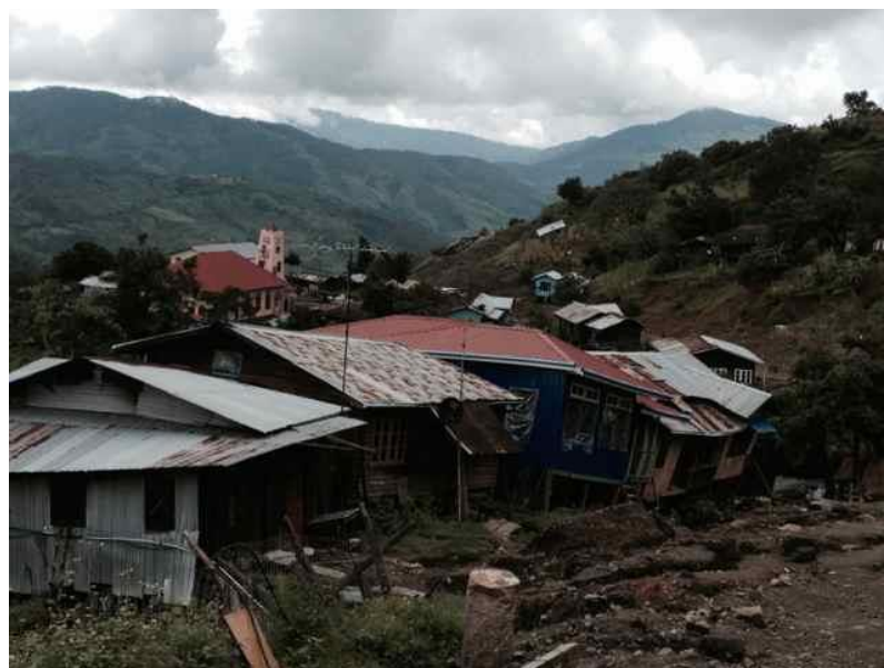
Destroyed houses, S Barton Hakha, 10/09/15